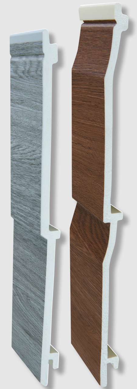
DOUBLE FEATHER EDGE